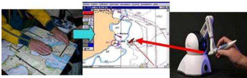
Fig. 3: From paper tactile maritime map to virtual haptic one.

One particular spatial feature of sailing consists of tacking when the destination is in front of the wind. When sailors zigzag, they do not follow a route but realize spatial inference tasks. In other words, if they want to reach point A, they first sail toward an imaginary point B and wait a short time and turn. This is a very difficult situation to explain orally while the boat is heeling. Moreover, if the crew encounter rocks in their path, blind people can no longer remain at the helm. Today, accurate information is available by the means of GPS (Global positioning system). However, map knowledge is required if the sailor wants to control his voyage, coordinates, bearings, distances, and waypoints. In this respect, we are devoting our work to create cartographic software that will enable blind people to learn mapping and prepare trajectories.